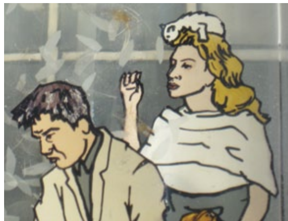
The Sweet Life, (details)