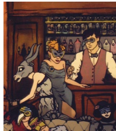
ABOVE The Masquerade (detail)