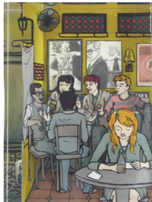
BELOW The Pub acrylic resin, mixed media, 8" x 6" x 3"