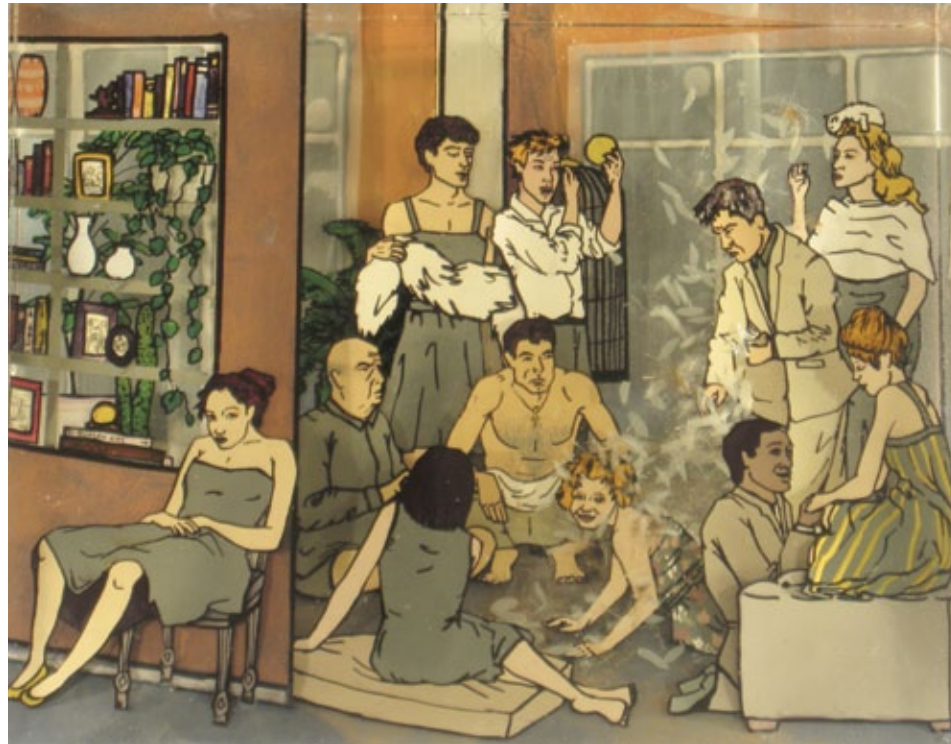
The Sweet Life, acrylic resin, mixed media, 8" x 10" x 3.25"