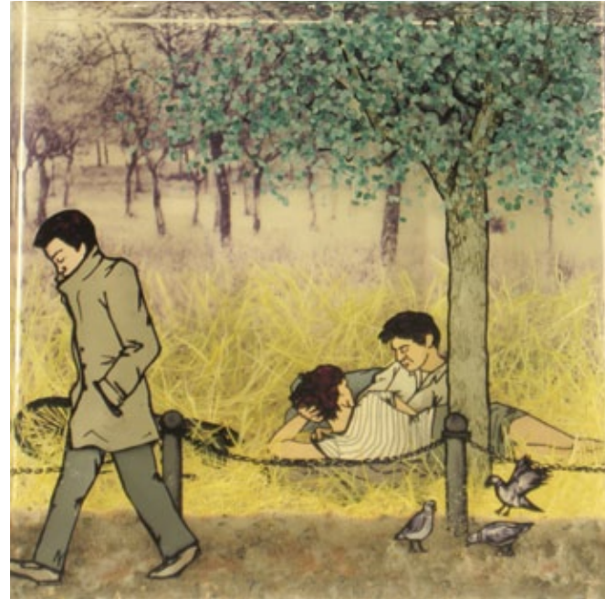
The Park, acrylic resin, mixed media, 8" x 8" x 3"