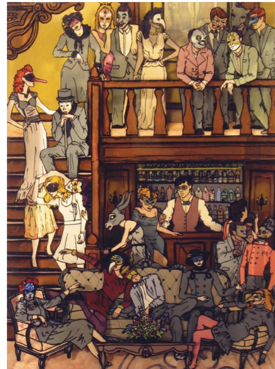
ABOVE The Masquerade, Acrylic resin, mixed media, 12" x 9" x 3.25"