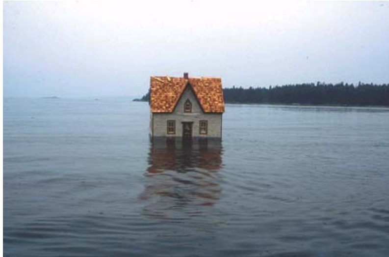
Paulette Phillips The Floating House 2002 Film still Courtesy the artist